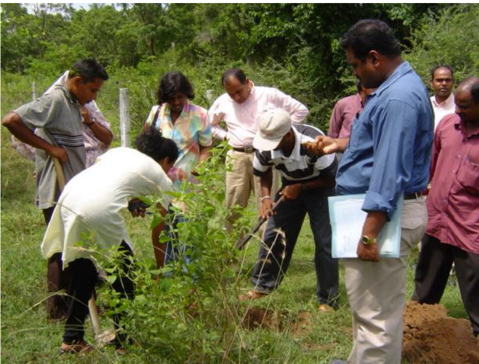
Figure 7: