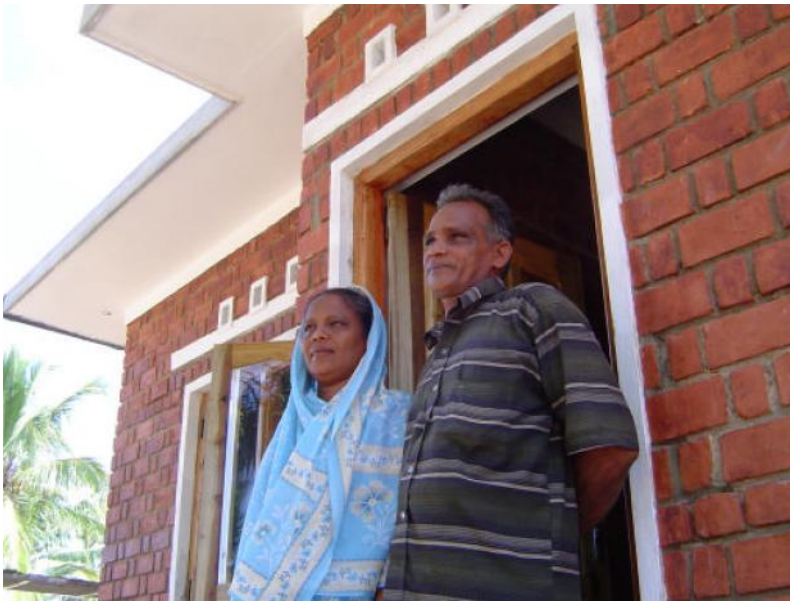
Figure 8: Photo credit: Practical Action South Asia

Collaboration among local authorities, private sector service providers and government organisations in charge of providing basic amenities such as roads, water and electricity is essential in planning housing schemes.